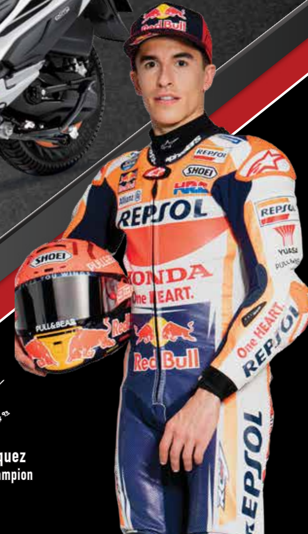
Marc Márquez MotoGP™ Champion

BOOK ONLINE NOW! www.honda2wheelersindia.com